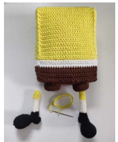
img 10 / 11. Attaching the shoe and leg to the body