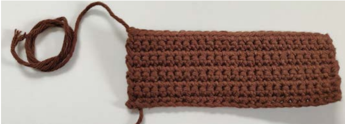
img 3. Finished bottom

Row 10: Sc each St, ch 1, bind off (25 Sts), img 3.