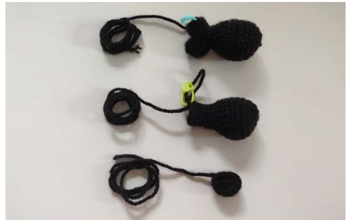
img 9. Attach the heel to the shoe