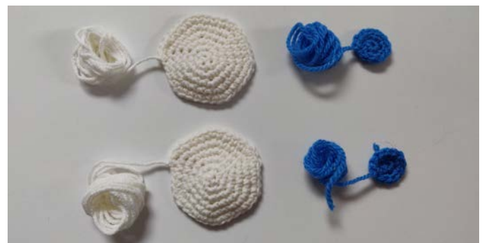
img 14. Eyes and iris.

Make a magic ring with 6 Sc, bind off and leave a long tail for sewing.