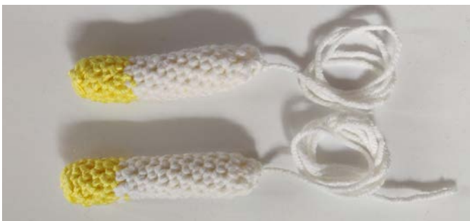
img 8. The legs