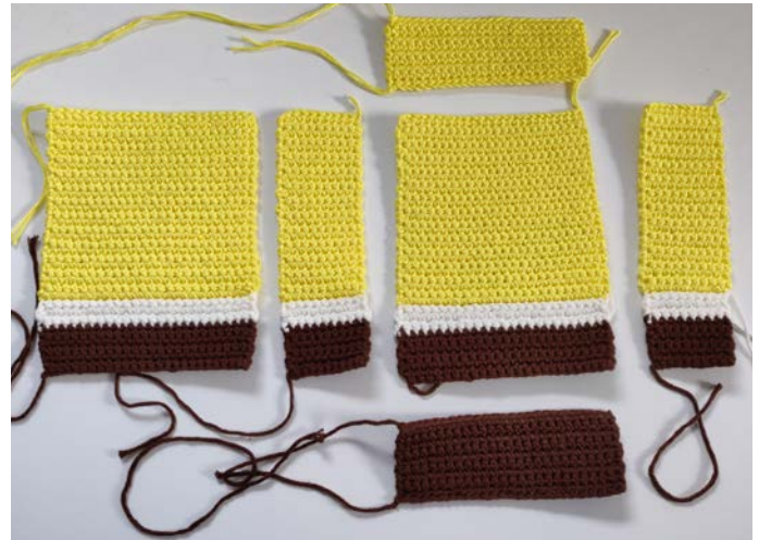
img 5. Layout of the finished body parts

Close up the body when you are happy with the amount of filling.