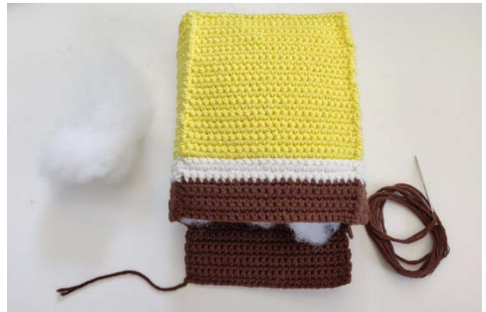
img 6. Stuff the body before closing