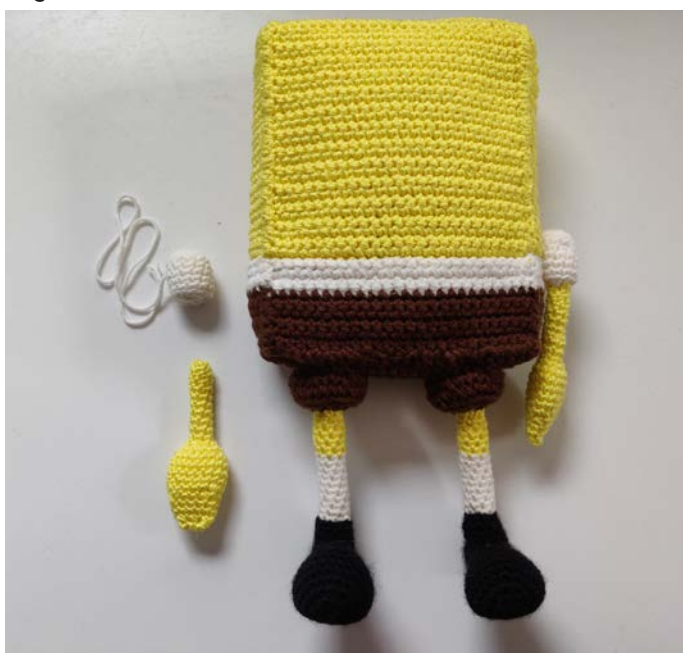
img 12. Attach the arms and sleeves to the body.