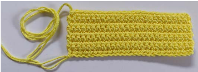
img 4. Finished top

Row 10: Sc each St, Ch 1, bind off (25 Sts), img 4.