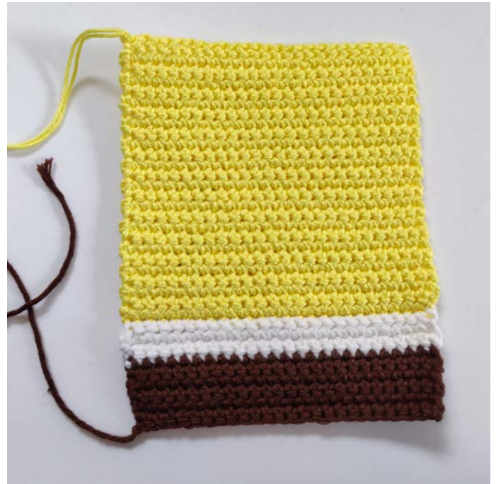
img 1. Finished front/back

Row 37: Sc each St, Ch 1, bind off (25 Sts), img 1.