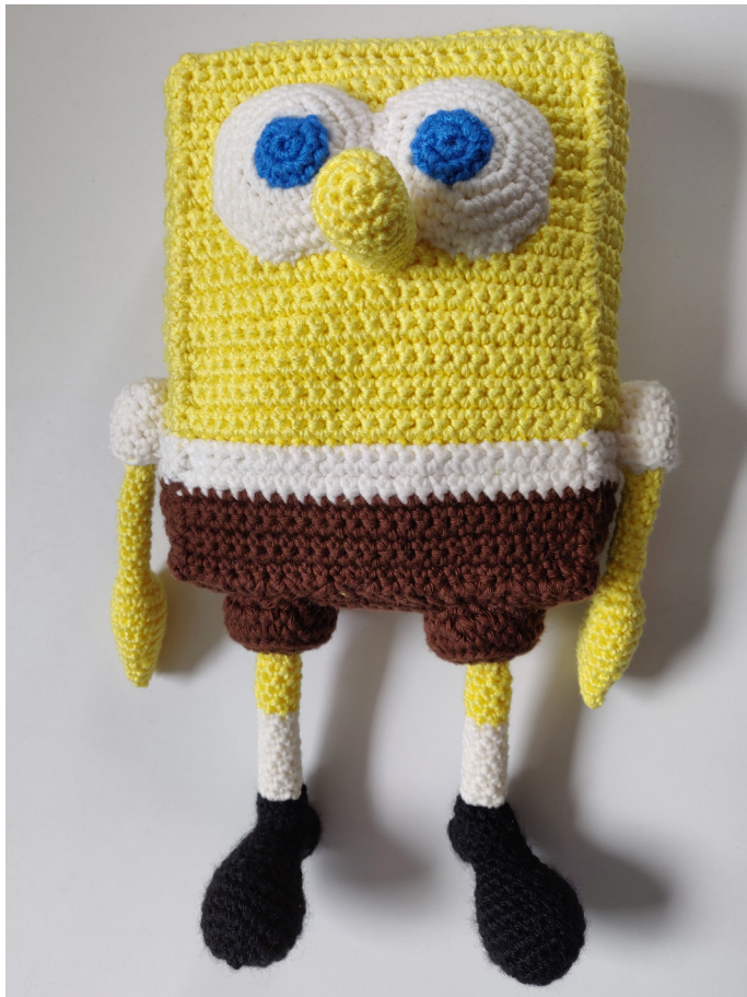
img 13. Attach the nose and eyes

Attach the eyes right above the nose and stuff it lightly with filling. Proceed with attaching the Iris and pupil right on top of those eyes.