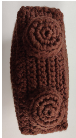
img 7. Attach the pants to the underside of the body.