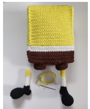
img 10 / 11. Attaching the shoe and leg to the body