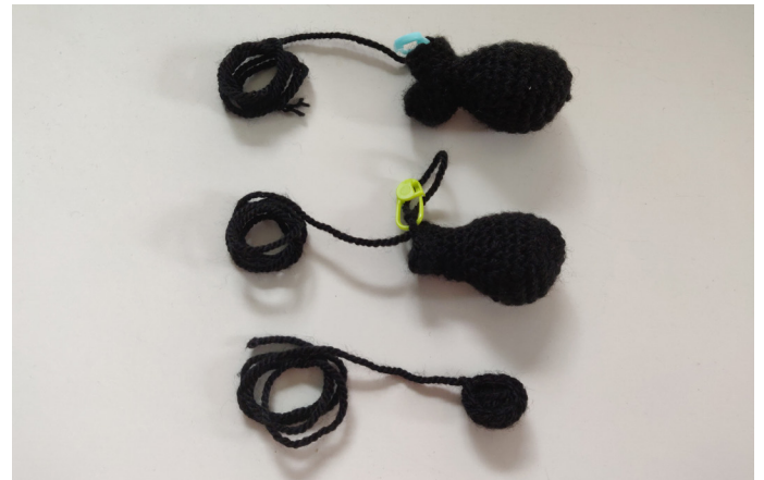
img 9. Attach the heel to the shoe

Rnd 16: Sc 6, bind off and leave a long tail for sewing