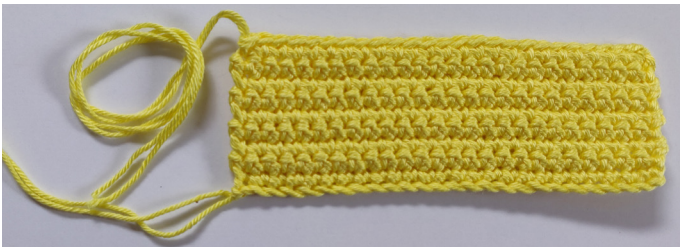
img 4. Finished top

Row 10: Sc each St, Ch 1, bind off (25 Sts), img 4 .