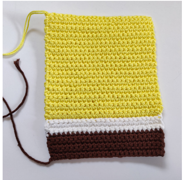
img 1. Finished front/back

Row 37: Sc each St, Ch 1, bind off (25 Sts), img 1.