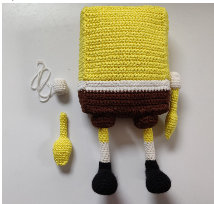
img 12. Attach the arms and sleeves to the body.