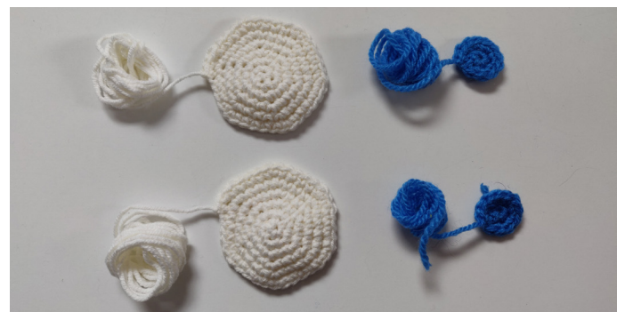
img 14. Eyes and iris.

Make a magic ring with 6 Sc, bind off and leave a long tail for sewing.