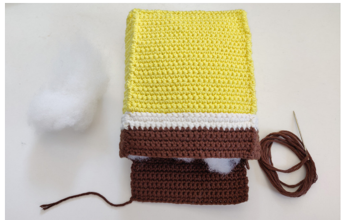
img 6. Stuff the body before closing