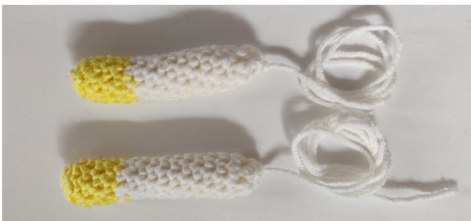
img 8. The legs