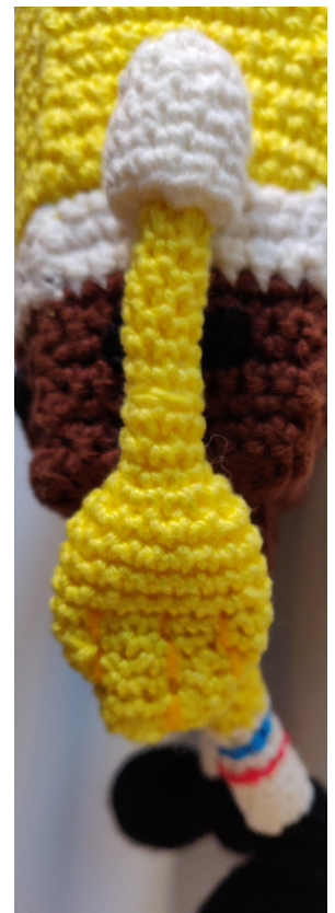
img 14. creating fingers on the hands