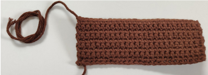
img 3. Finished bottom

Row 10: Sc each St, ch 1, bind off (25 Sts), img 3 .